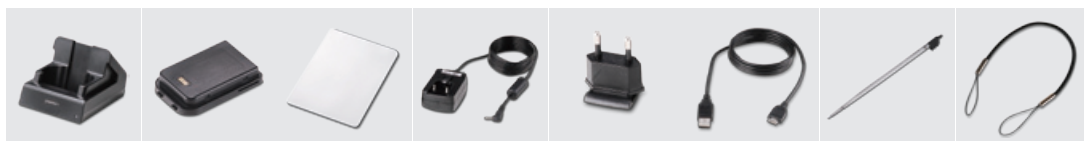
Cradle Battery Protection Film Adapter Adapter Connector USB Cable Stylus Pen Tether